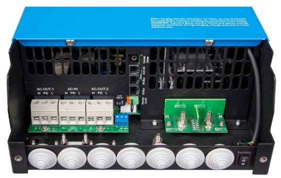
Connection Area MultiPlus-II 3k